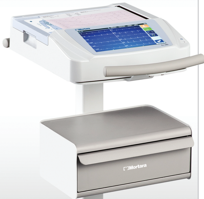
12-LEAD resting electrocardiograph

Bidirectional communication via LAN or wireless LAN enables connectivity to Mortara's Pyramis®, HeartCentrix®, E-Scribe™ and Athena products, as well as to third party EHR, PACS and CVIS. ELI 280 also communicates to Mortara's ECG Safe™, a cloud-based service that provides an easy, effective way to store ECGs for convenient viewing and file management from anywhere.