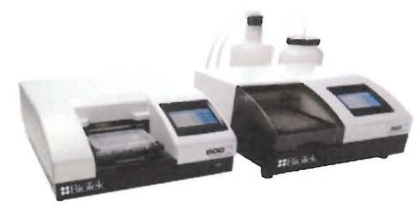
BioTek's 50™ TS Washer is ideal for pairing with 800 TS for routine workflows