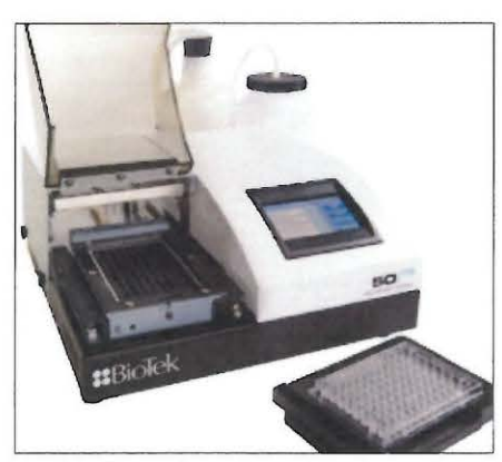
Wash filter-bottom plates and magnetic bead assays with