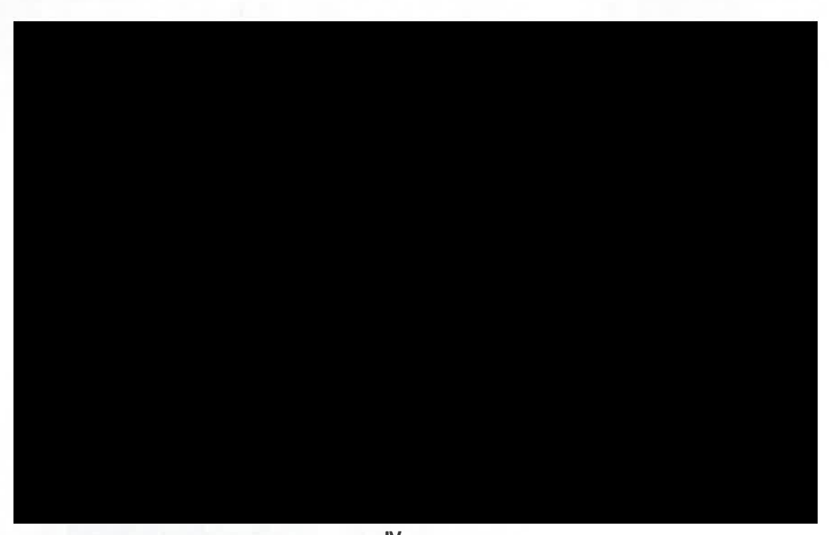
IV. Price Calculation