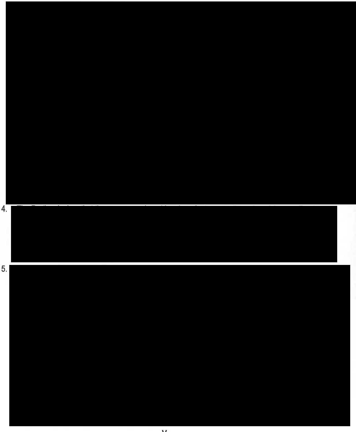
V. Final Provisions