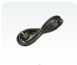
2 Power cords