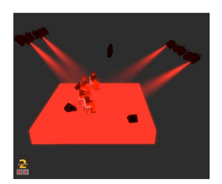
Fader 5 - full red light PC Fresnel