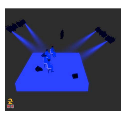
Fader 4 - full blue light PC Fresnel