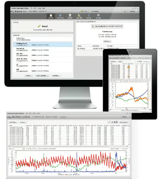
Quickly View Trends

Quickly view the current status of the instrument to ensure proper functionality