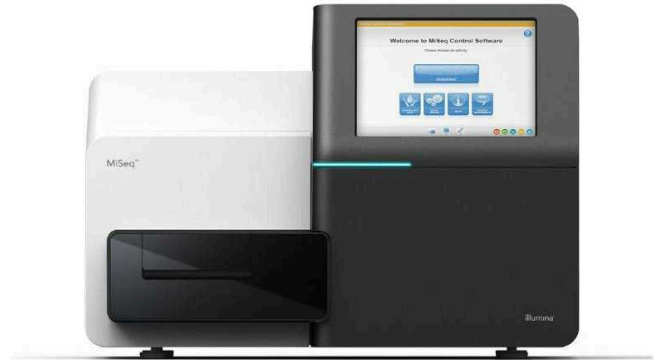
Figure 1: MiSeq System—The compact MiSeq System is well suited for rapid, cost-effective next-generation sequencing.

The MiSeq System offers the first DNA-to-data sequencing platform integrating cluster generation, amplification, sequencing, and data analysis into a single instrument. Its small footprint—approximately two square feet—fits easily into virtually any laboratory environment (Figure 1). The MiSeq System leverages Illumina sequencing by synthesis (SBS) chemistry, a proven next-generation sequencing (NGS) technology responsible for generating more than 90% of the world's sequencing data. 1 With the power of NGS delivered in a compact footprint, the MiSeq System is the ideal platform for rapid and cost-effective genetic analysis.