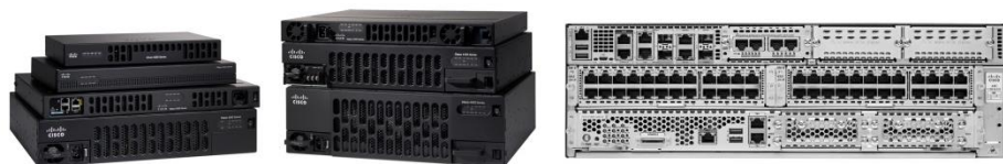
Figure 1. Cisco 4000 Series Integrated Services Routers

The Cisco 4000 Family contains the following platforms: the 4461, 4451, 4431, 4351, 4331, 4321 and 4221 ISRs.