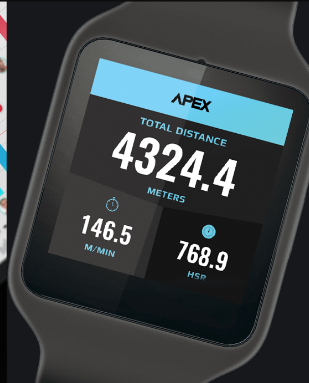
SMART WATCH APP