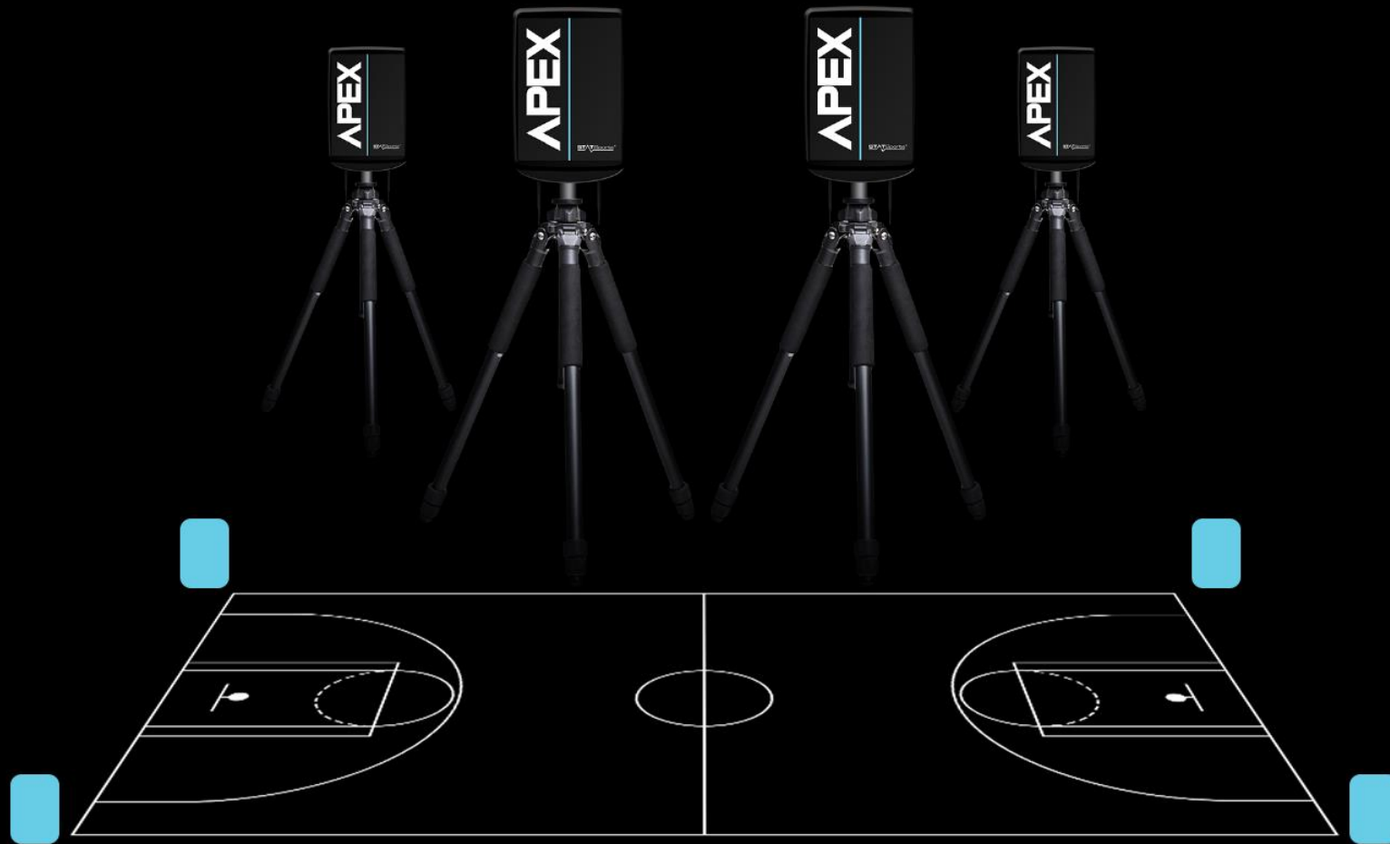
POSITIONING 4 UNFIXED BEACON SETUP