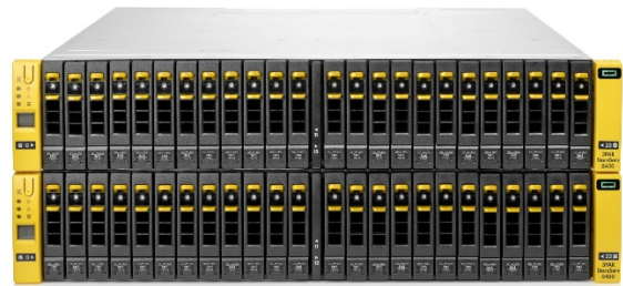
HPE 3PAR StoreServ 8000 Storage (4-Node Storage Base)