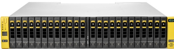
HPE 3PAR StoreServ 8000 Storage (2-Node Storage Base)

HPE 3PAR StoreServ 8000 is storage made effortless.