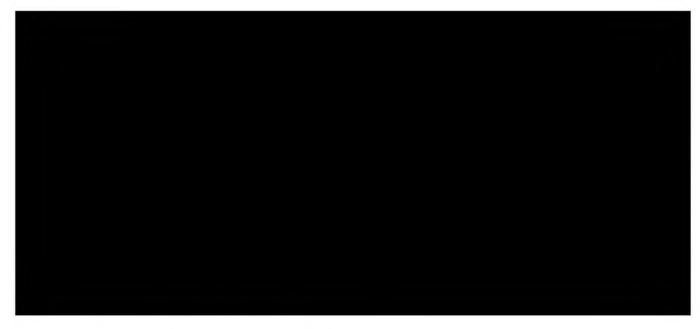
Hosting Services to be provided by INDRA include the following: