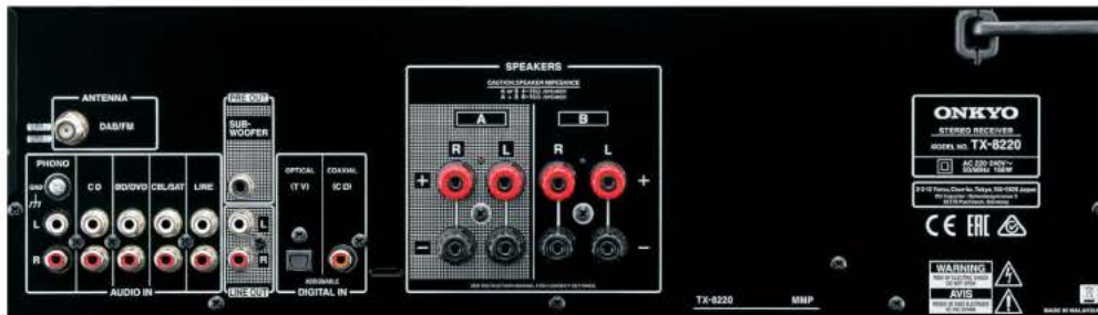
Text on receiver may vary with region.

specifications and appearance without notice. The Bluetooth® word mark and logos are owned by the Bluetooth SIG, Inc. WRAT is a trademark of Onkyo Corporation.