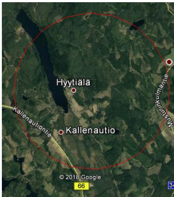
Hyytiälä research site